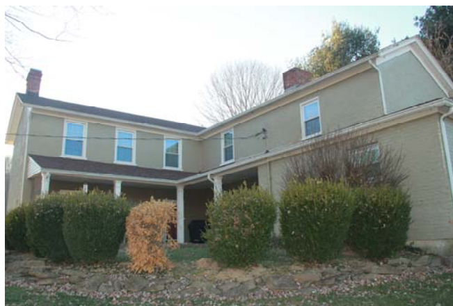
Back side (on left) and east side of ell (at right)