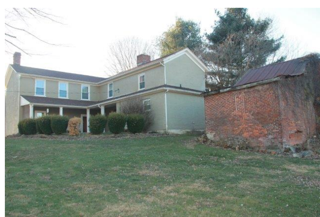
Secondary Building (shot looking north)