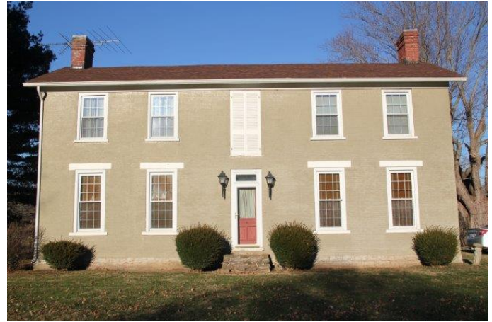
Stroufe House (from highway)