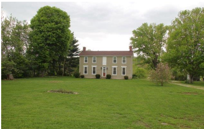
Stroufe House (from highway)

property is flat and grassy. There are several large trees on the acreage around the north and west property boundaries. Walkabout Lane runs along the east edge of the property. This lane connects another property, north of the Stroufe House, with the highway.