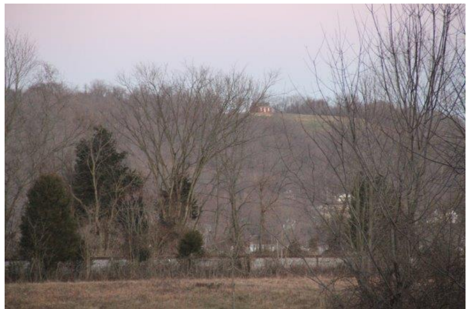
Sroufe House & Outbuildings