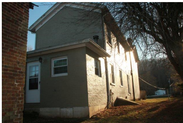
One-story 1970s addition